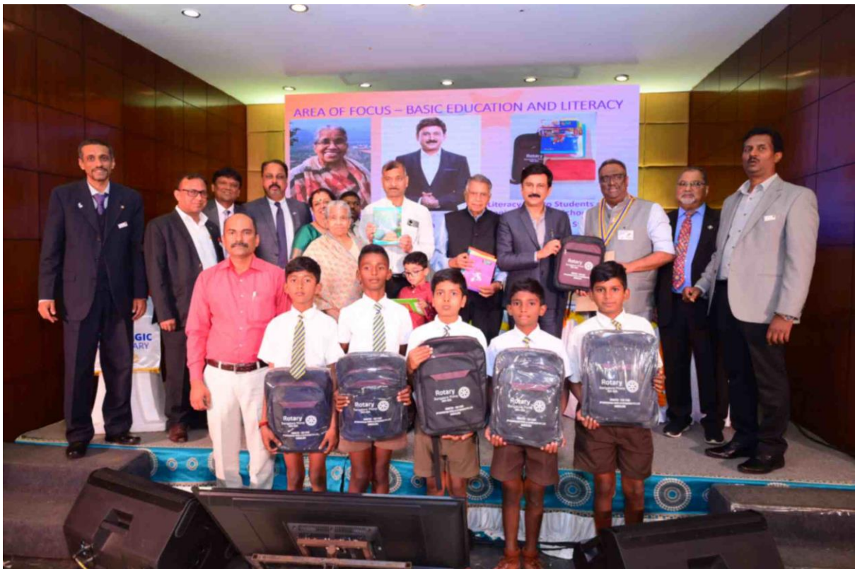
Figure 11: Bimala Devi Educational Kits to Students