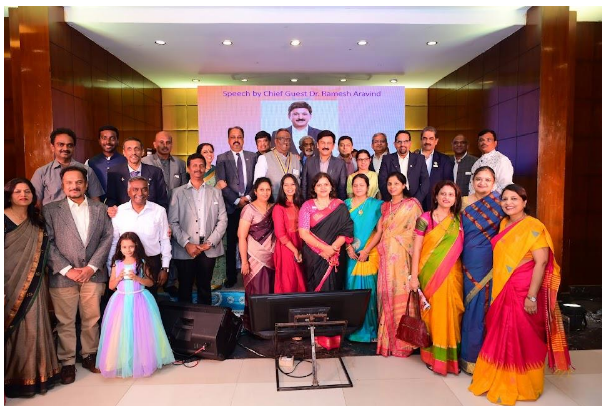
Figure 2: Prime Members at Installation Ceremony