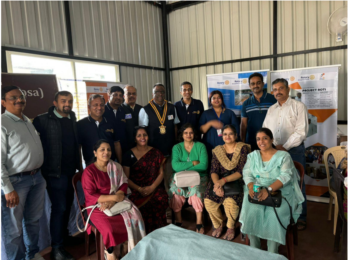
Figure 3: Members at AiR Humanitarian Homes