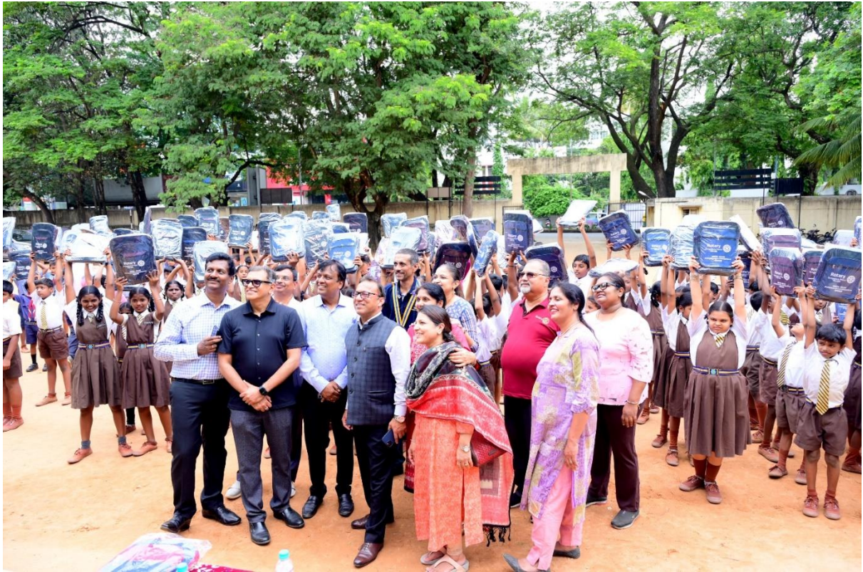
Figure 12: Educational Kits distributed to Students