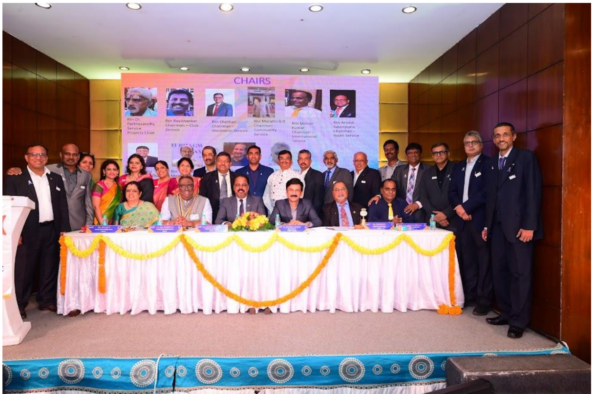
Figure 16: Board Members for RY2024-25