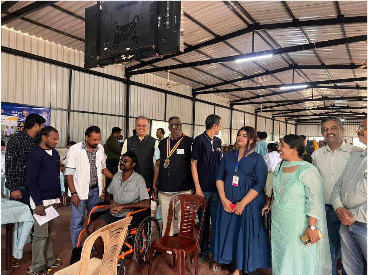
Figure 7: Mega Eye Camp at AiR Humanitarian Homes