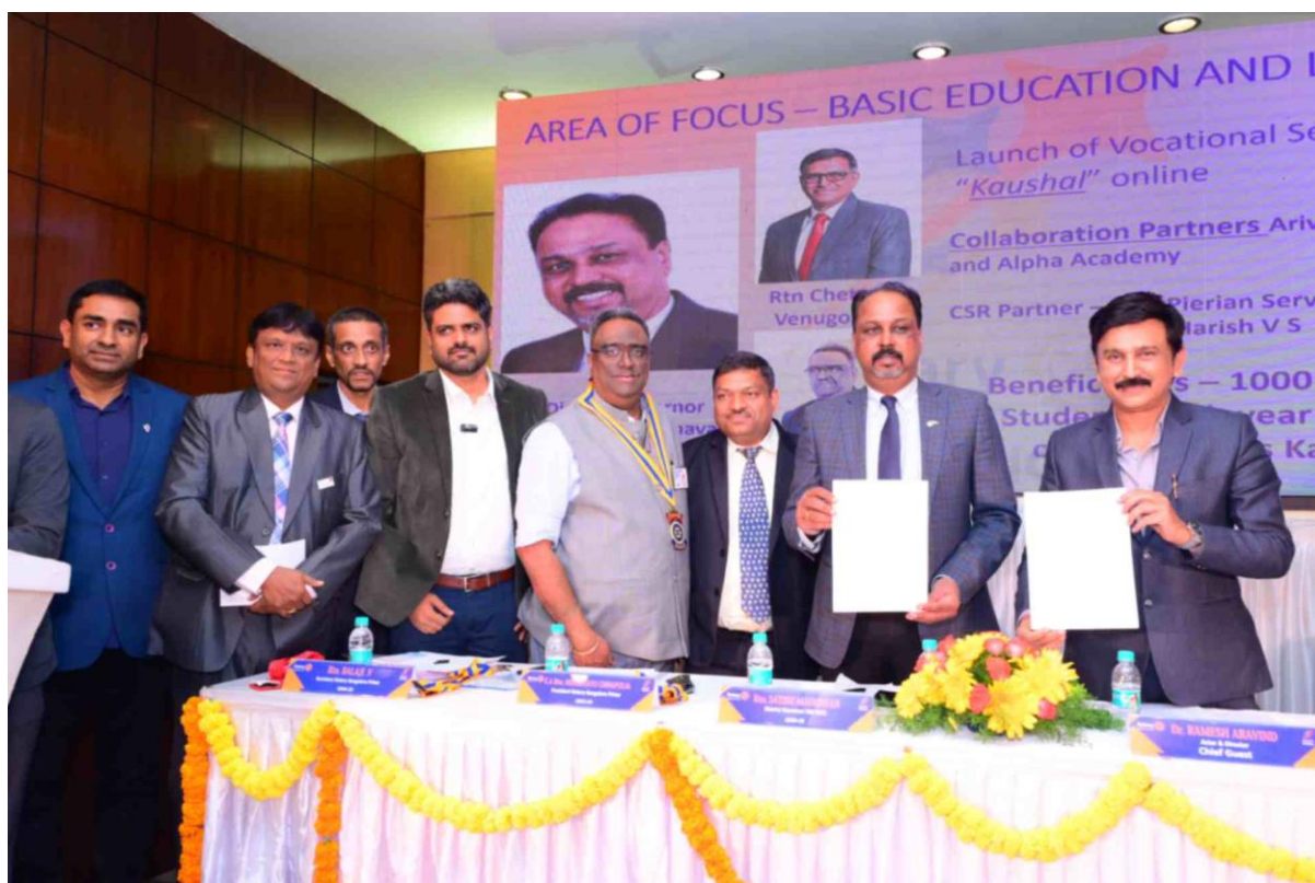
Figure 6: Launch of Kaushal Online