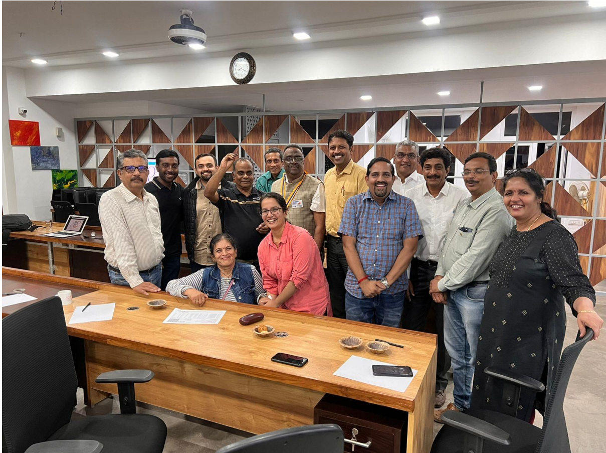
Figure 14: New Member Orientation

11 New Members were inducted to the club. 1 Honorary member was also inducted into the club. Rtn Mohankumar conducted an orientation session for all new members.